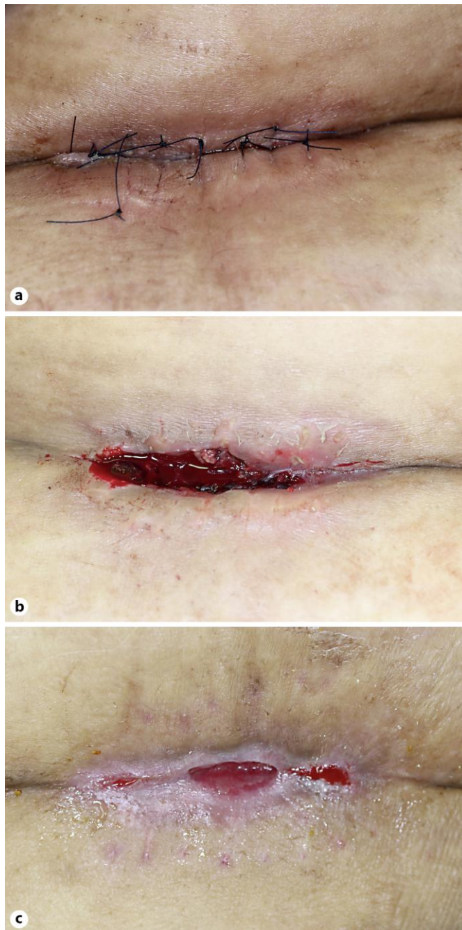
Fig. 1. Clinical appearance of the postoperative wound on the patient's lower abdomen. The ulcer had been sutured at the emergency department of our hospital 3 days before the patient's first consultation with the department of dermatology (a). On admission at the department of dermatology 6 days later, the suture had completely disappeared (b). After VAC therapy, the abdominal ulcer rapidly became granulated and reepithelialized (c).

Inui et al.: Intractable Postoperative Wounds Caused by Self-Inflicted Trauma in a Patient with Cutaneous Munchausen Syndrome