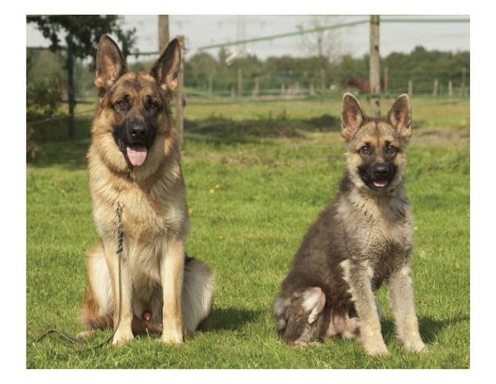
Figure 1. Two fourteen-month-old male German shepherd dogs from the same litter. A healthy German shepherd dog (C8, left) and his littermate that is affected by pituitary dwarfism (C6, right). Note the proportionate growth retardation, the retention of puppy hairs and the lack of guard hairs of the dwarf. doi:10.1371/journal.pone.0027940.g001

were monomorphic in families A and B. Eleven of the remaining markers were heterozygous in only two parents and four markers were heterozygous in three parents. There was only one marker, REN177B24 on CFA09, for which all four parents were heterozygous. The three dwarfs were homozygous for allele 366 of this marker and their analyzed siblings were heterozygous. Therefore, REN177B24 was the first marker to be analyzed further according to our selection criteria and all available dwarfs, parents, and siblings were genotyped with this marker. Three of the 23 dwarfs were not homozygous for the allele of 366 bp (D15, F4, F9). Just one out of nine available parents (D9) and one out of 17 normal siblings (D14) were homozygous for this allele. The homozygous sibling was an offspring of the homozygous parent. The frequency of the associated 366 bp allele was 94% in the group of dwarfs, 56% in the parents, and 44% in the siblings. These results showed that the dwarfism phenotype is strongly associated with marker REN177B24.