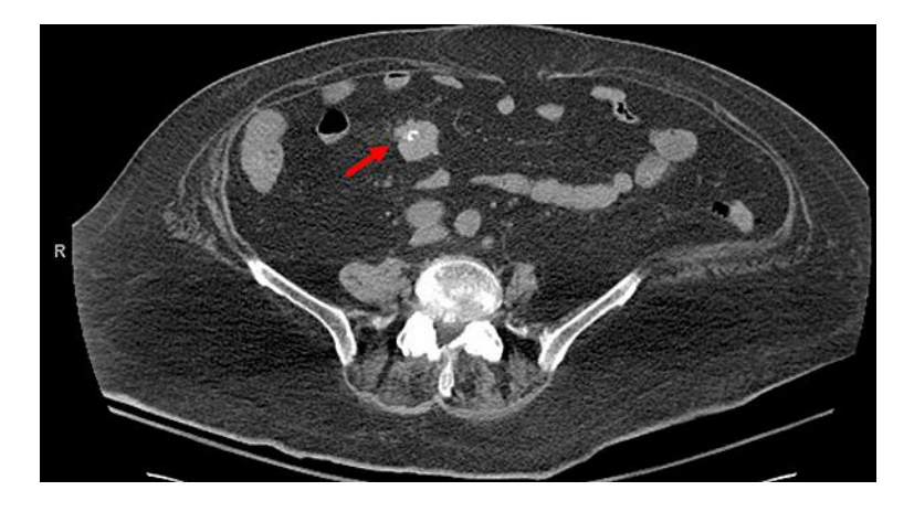
Fig. 1. Axial computed tomography of the abdomen showing mesenteric carcinoid tumor with central calcification (arrow).