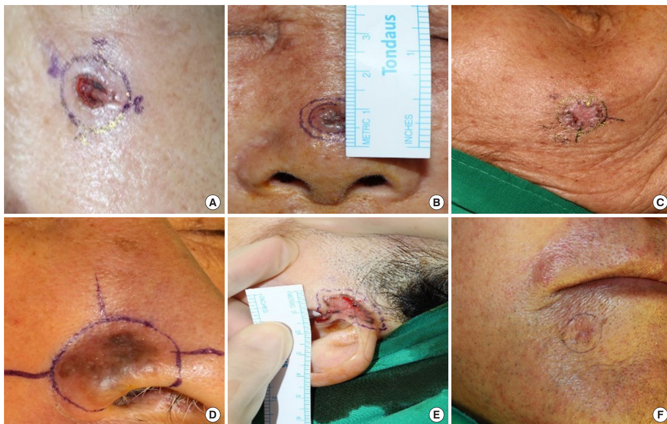
Fig. 1. Margin demarcation according to the gross appearance. Wide excision was performed with a safety margin of 2 mm (A-C) or 3 mm (D-F) depending on the gross appearance of basal cell carcinoma in various areas.

respectively. We used a surgical margin of 2 mm and 3 mm in 134 and 50 patients, respectively.