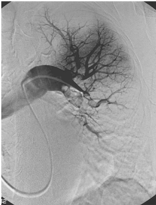
Fig. 2. Angiogram to show minimal improvement in left lung perfusion following 24 hours thrombolytic therapy.