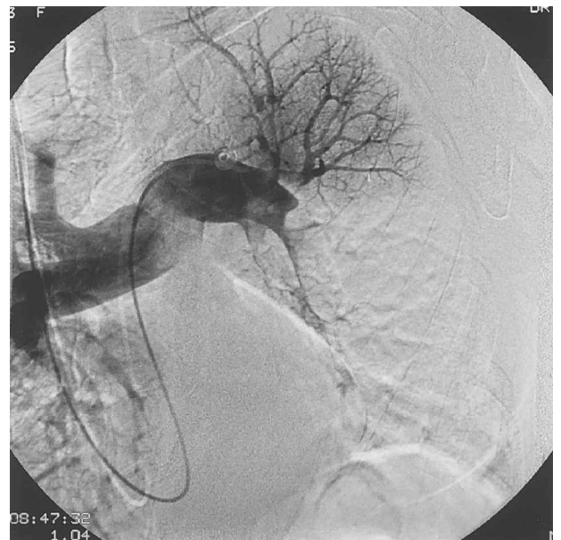
Fig. 1. Angiogram to show the perfusion defect in the left lung prior to thrombolytic therapy principally affecting the left inferior pulmonary artery.

V/Q scan confirmed bilateral gross perfusion defects with sparing of the left apical region and normal ventilation profile. Consecutive echo-cardiograms demonstrated a dilated right ventricle with reversed septal motion and dilated right atrium. The pulmonary artery pressure was 74 mmHg. This failed to improve, as did her oxygen saturation on