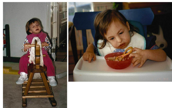
Figure 3 This girl, now 16 years of age and very healthy, had a ventricular septal defect repair as an infant; she is shown here at various ages enjoying a favorite pastime and feeding herself. She is walking with assistance but can climb stairs on her own.

As mentioned above (see "Etiology and Pathogenesis") among patients with mosaic trisomy 18 the phenotype is extremely variable, and there is no correlation between the percentage of trisomy 18 cells in either blood cells or skin fibroblasts and the severity of intellectual disabilities [24].