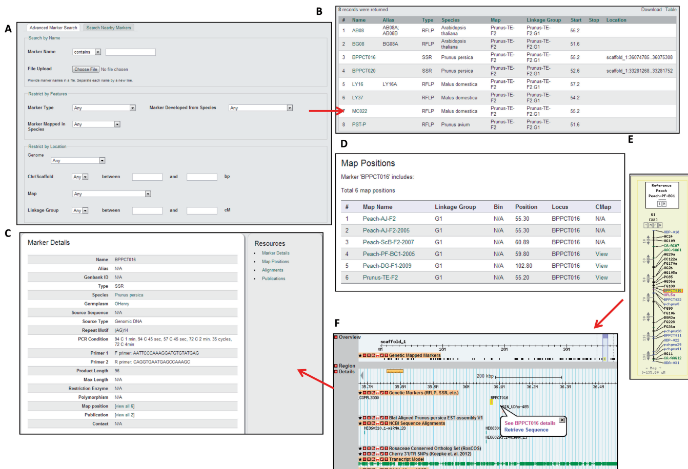
Figure 2. Marker search site in the GDR. (A) The advanced marker search site allows researchers to search markers by name, type, species and whole genome or genetic map locations. (B) The search results page shows information such as links to download data and the marker details page. (C) The marker details page with various tabs to show the detailed information. (D) The map position tab of the marker page shows all maps in which a marker has been mapped. (E) From the marker page, researchers can go to CMap. (F) For genome-anchored markers, CMap provides a hyperlink to GBrowse. From GBrowse, researchers can follow the link to go back to CMap, the marker details page or the Sequence Retrieval Tool.

Breeding data stored in the GDR include phenotypic data, genotypic data, germplasm and pedigree data from the