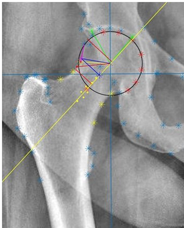
FIGURE 2 Measuring cam morphology using statistical shape modeling

We defined cam morphology and severity of cam in the right and left hip by using previous published standardized cut off points established in the CHECK study. 5 Furthermore, we also assessed the associations of moderate and severe cam morphology in each hip. Severity of cam morphology was categorized as follows. No