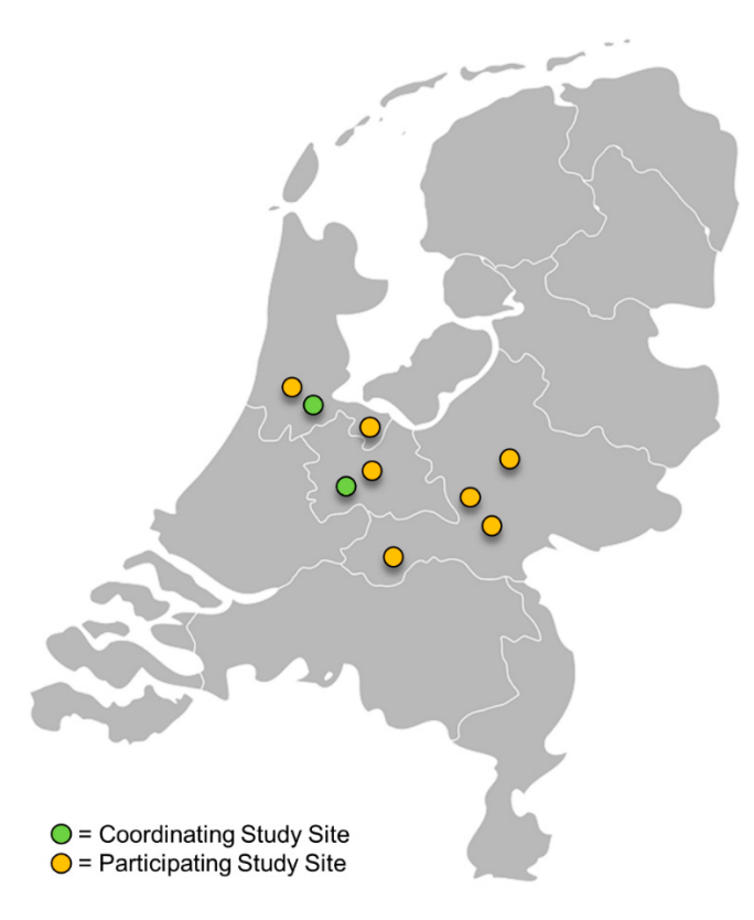
Figure 1. Geographical locations of cardiac centers participating in the Future Optimal Research and Care Evaluation in patients with Acute Coronary Syndrome (FORCE-ACS) registry.