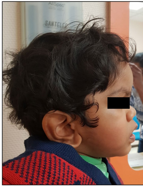
FIGURE 1 Photographs of the face and profile of patient 2 at 3 years of age demonstrating facial dysmorphism including low-set ears, prominent forehead, retrognathia, hypertelorism, anteverted nares, scaphocephaly, and horizontal palpebral fissures