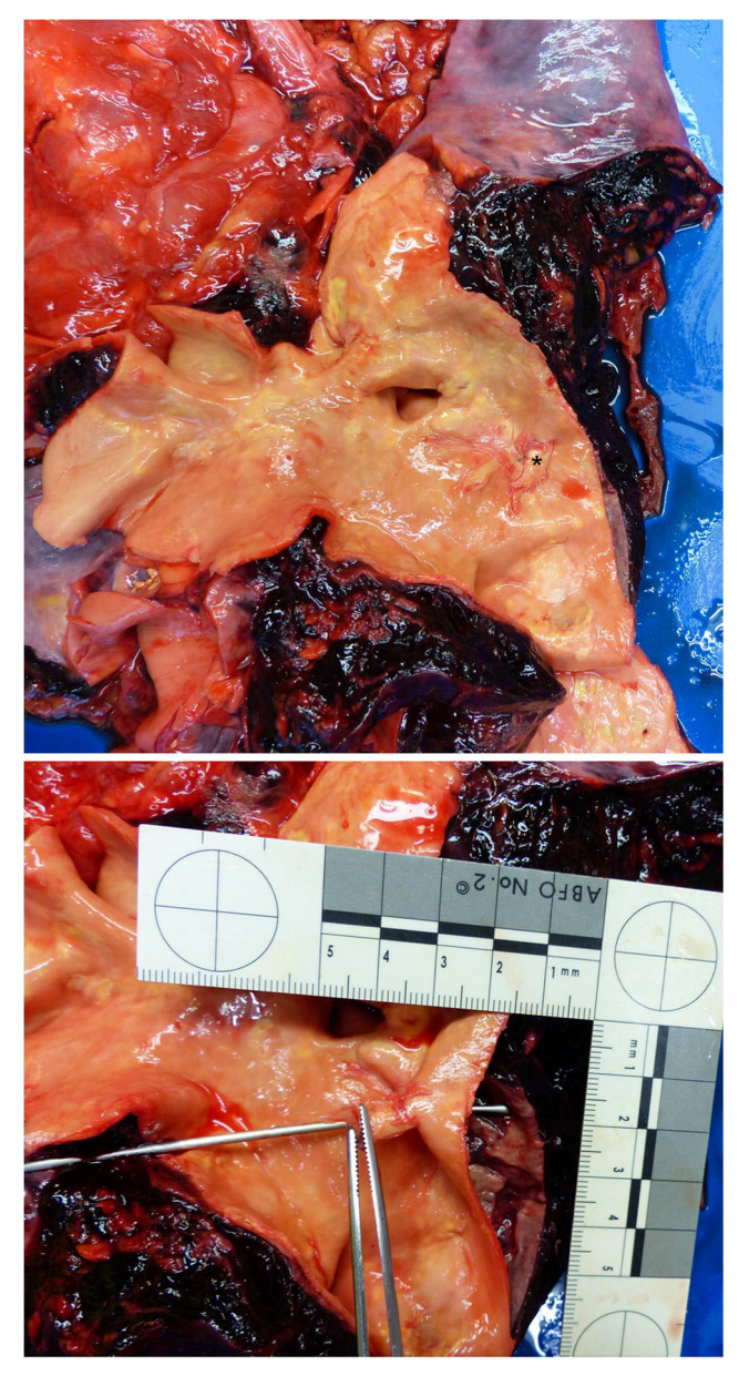
Fig. 2 Aortic arch with a tear (*) after removal of the neck organs with surrounding hemorrhage

number of patients are likely to be affected by fatal vascular complications, such as IAD. Although the risk for IAD is relatively low, between 24 and 36 patients in Germany and between 109 and 164 patients in the USA could be affected by