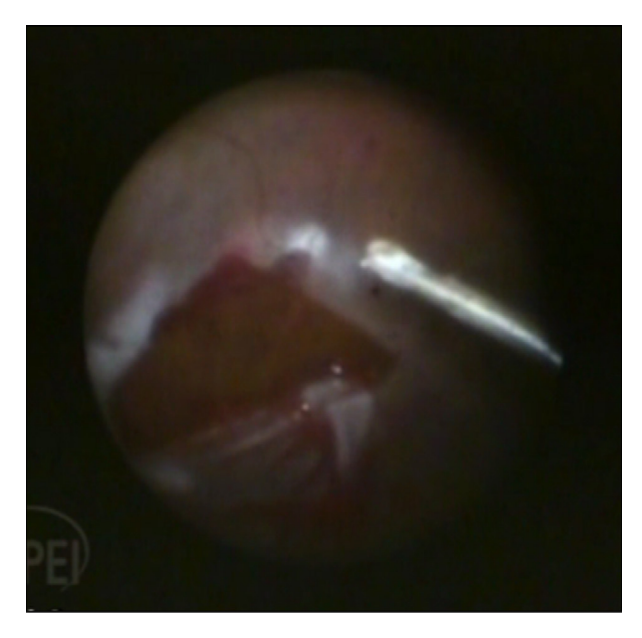
Figure 4 Figure shows retina flattened under perfluorcarbon liquid and a large retinal break.

were endogenous, three eyes (9.09%) were post-perforated corneal ulcer, two eyes (6.06%) as post-retinal surgery, and one eye (3.03%) was post-combined cataract and corneal surgery (Table 1).