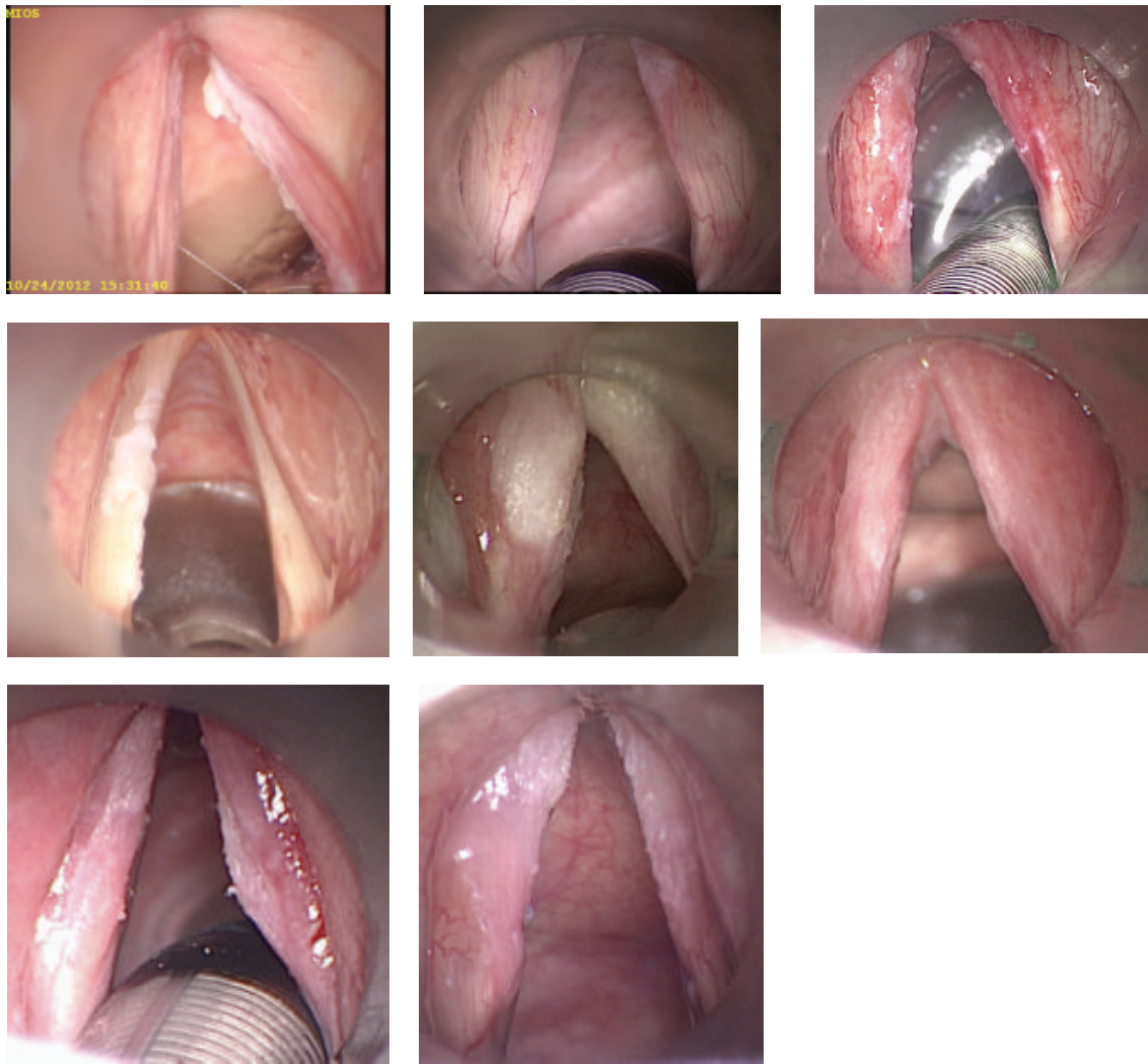
FIGURE 1: Photographs of laryngeal lesions presented in this survey.