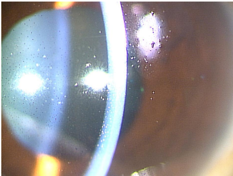
Fig. 1. Slit-lamp photograph of the patient's left eye. Mild iritis and a large number of pigment cell kerato-precipitates can be seen.