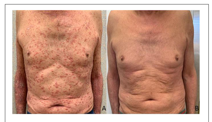
FIGURE 1 | Clinical presentation of the patient before the treatment with Apremilast (A). Resolution of psoriasis after the treatment with Apremilast (B).

Due to the severity of psoriasis, following a multidisciplinary discussion of the clinical case, the patient underwent treatment with Apremilast at an initial 5-day titration dose of 10 mg