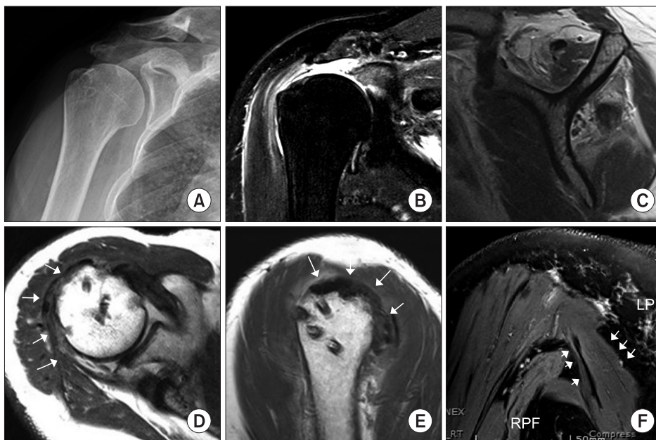
Fig. 2. Arthroscopic-assisted latissimus dorsi (LD) tendon transfer of a 61-year-old female patient in right shoulder. She had no arthritis or superior migration of the humeral head on preoperative simple X-ray (A), while preoperative magnetic resonance imaging (MRI) showed full-thickness rotator cuff tear with retraction, muscle atrophy and fatty infiltration of the supraspinatus and the infraspinatus (B, T2-weighted with fat suppression, coronal image; and C, T1-weighted sagittal oblique image). At 6-months postoperatively, follow-up MRIs shows intact continuity of the transferred latissimus dorsi (LD) tendon (arrows) on the greater tuberosity (D, T2-weighted axial image; E, T2-weighted sagittal oblique image). (F) Notably, transferred LD muscle (arrows) below the deltoid muscle was well-visualized (T2-weighted with fat suppression, coronal oblique image).

VAS: visual analogue scale, ASES: American Shoulder and Elbow Surgeon, UCLA: University of California Los Angeles, Pre: Preoperative value, Post: Postoperative value.