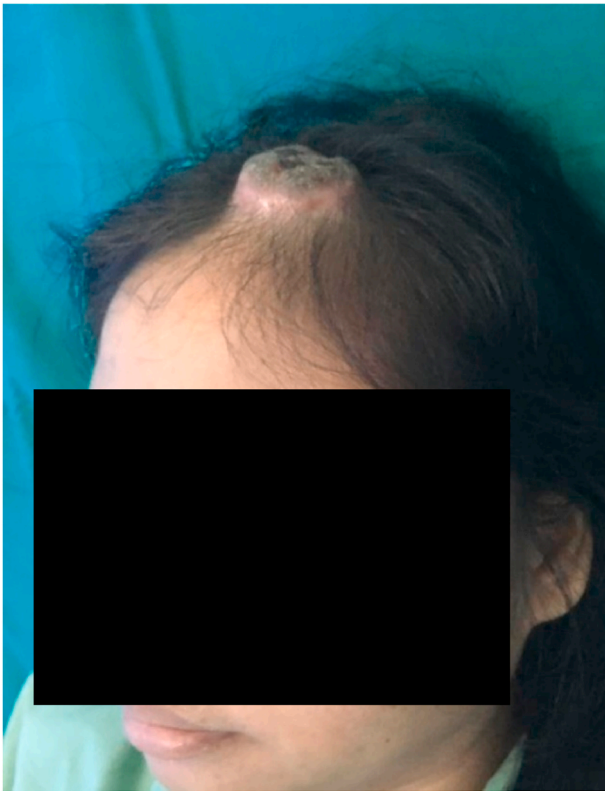
Fig. 1. Scalp lesion of Eccrine Tumor.

with irregular margin & necrotic center seen at the left frontal aspect measuring 2.9 cm × 3.3 cm × 1.5cm, has poor plane with overlying skin & underlying skull bone, no bony erosion (Fig. 2). Other finding of CT brain was of enlarged left intra-parotid lymph node, suspicious of metastatic foci and multiple thyroid nodules. Further USG done with finding