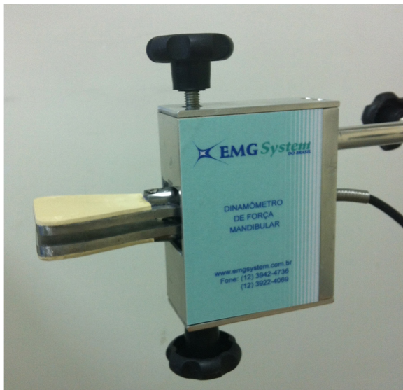
Figure 4 Mandibular force transducer equipment used in this study.

aluminum-GaAIs (TWIN Laser, Optics brand MM), emitting at a wavelength of 660 nm, with a constant power 40 mW, and a maximum beam diameter of 0.38 cm 2 . Groups 3 and 5 will be irradiated with a light emitting diode (LED), emitting a wavelength band of 630 ± 5 nm, with a constant power 40 mW, and the maximum laser beam diameter of 0.38 cm 2 . Both will be operated in continuous mode and should be used in contact with the target tissue, providing an irradiance or intensity of 0.40 mW/cm 2 . The incidence of fluency range for each