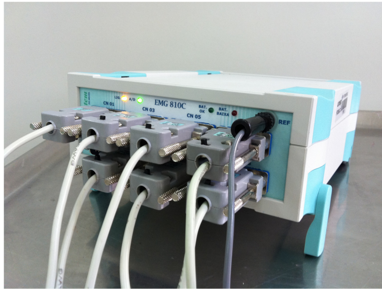
Figure 2 Electromyography equipment used in this study.

nerve; 2. area prior to the sigmoid notch, insertion area of the lateral pterygoid muscle (upper beam) at the neck of the condyle and disk; 3. articular interface between condyle and fossa with open mouth; 4. angle of the jaw; 5. anterior temporal muscle; 6. middle portion of the temporal muscle; 7. posterior portion of the temporal muscle; 8.