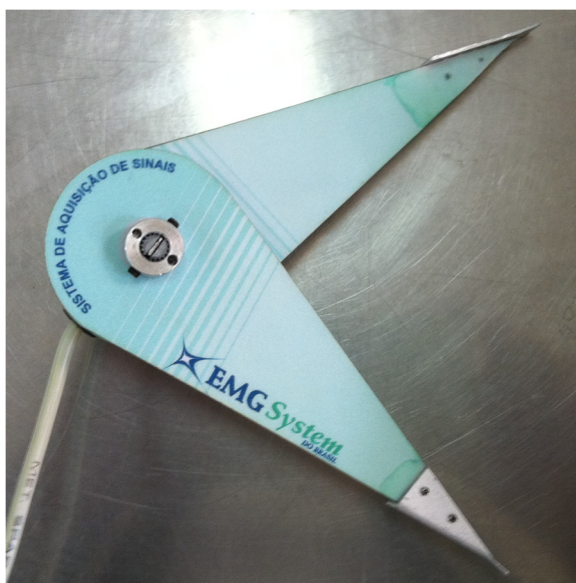
Figure 5 Mandibular goniometer equipment used in this study.

aluminum-GaAIs (TWIN Laser, Optics brand MM), emitting at a wavelength of 660 nm, with a constant power 40 mW, and a maximum beam diameter of 0.38 cm 2 . Groups 3 and 5 will be irradiated with a light emitting diode (LED), emitting a wavelength band of 630 ± 5 nm, with a constant power 40 mW, and the maximum laser beam diameter of 0.38 cm 2 . Both will be operated in continuous mode and should be used in contact with the target tissue, providing an irradiance or intensity of 0.40 mW/cm 2 . The incidence of fluency range for each