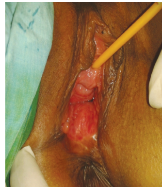
Figure 3 - Urethral calibration after one year, with wide urethral lumen and very healthy vagina.