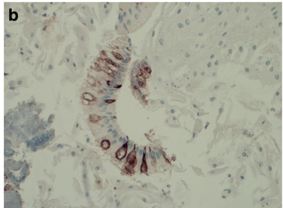
Fig. 1 (a) Cytosponge<sup>™</sup> expanded (left) and in gelatin capsule (right) (b) representative picture of positive TFF3 staining in a sample from a patient with BE (× 20 magnification)

serious adverse events were attributed to the Cytosponge™ after administering this test over 2000 patients, showing that it is a safe intervention [11, 13-16]. Second, the Cytosponge<sup>™</sup> is acceptable to patients with a mean score of 6.0 (95%CI 5.0-8.0) on a visual analogue scale from zero (worst experience) to 10 (best experience) reported by patients [11, 13–16]. Third, the Cytosponge intervention was shown to be transferable to the NHS: 27 nurses were trained with a single training session in 11 sites and sample processing was run in an NHS pathology laboratory [13, 17]. Fourth, a feasibility study conducted in 504 patients in 11 general practices showed that the intervention can be applied to primary care [13]. Fifth, the Cytosponge™-TFF3 test was found to be accurate for diagnosing BE regardless of patient cohort or study setting. Last, this test is cost-effective in comparison to the usual care. A micro-simulation model suggested a gain of 0.015 QALYs (Quality adjusted life years) and an incremental cost effectiveness ratio (ICER) of $15,700 per QALY for Cytosponge<sup>™</sup> versus endoscopic diagnosis of BE followed by endoscopic treatment [18].