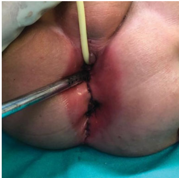
Fig. 4 Postoperative image: urinary catheter in urethra, suction catheter in vagina, and neoanus at inferior margin.

successfully performed at the age of 20 months (delayed due to the coronavirus pandemic). She is under continued renal follow-up and plans for a genitoplasty to correct the transposition of the clitoris and labia will be made going forward.