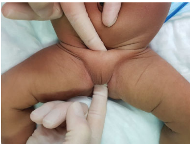
Fig. 1 Demonstration of thickened pubic symphysis.

Ultrasound was not able to confirm whether the balloon of the catheter was indeed within the bladder or within the vagina. As a result, the decision was made to take the child for an examination under anesthesia and perineal stimulation. The anal opening was confirmed to be significantly anterior to the sphincter complex. A laparotomy was therefore performed to fashion an end colostomy and drain the hydrocolpos. At laparotomy, a normal uterus and fallopian tubes were identified and the vagina appeared thickened and hypertrophic without significant fluid content. A formal vaginostomy was therefore not a feasible option as the vagina was not dilated enough to reach the abdominal wall. Hence, a