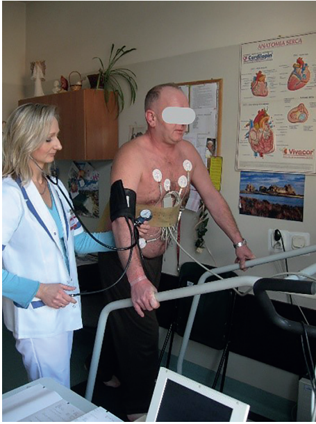
FIGURE 2: Exercise test on the treadmill with blood pressure (CTK), heart rate (CAS), and ECG monitoring.

national health services. At the same time, rehabilitation of patients with PAD in many countries is not eligible for refund.