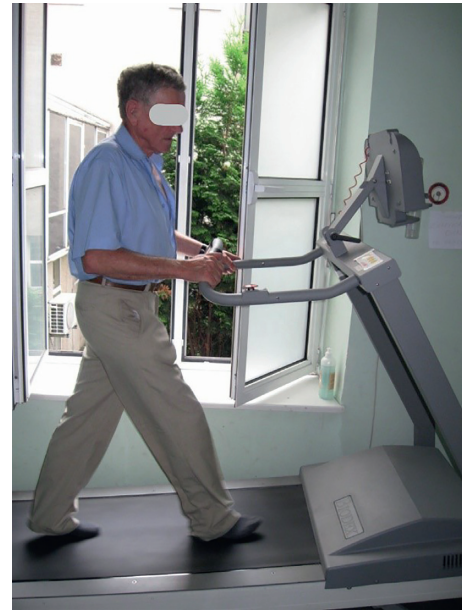
FIGURE 1: Treatment of claudication: treadmill training.

risk of injuries or complications. The mechanism underlying the increasing walking distance in patients with intermittent claudication following exercise therapy is not clear. This effect is not based on one mechanism but results from a combination of many factors. Authors of many publications emphasize that treadmill walking causes beneficial rheological changes, causing increased deformability of erythrocytes and decreased blood viscosity. It also leads to morphological changes in muscle fibers, thanks to the improved capillary flow. Finally, training changes the perception of pain through increased supply of endorphins, leads to so-called “walking economy” improvement, and importantly causes pleiotropic changes in metabolism [25–27].