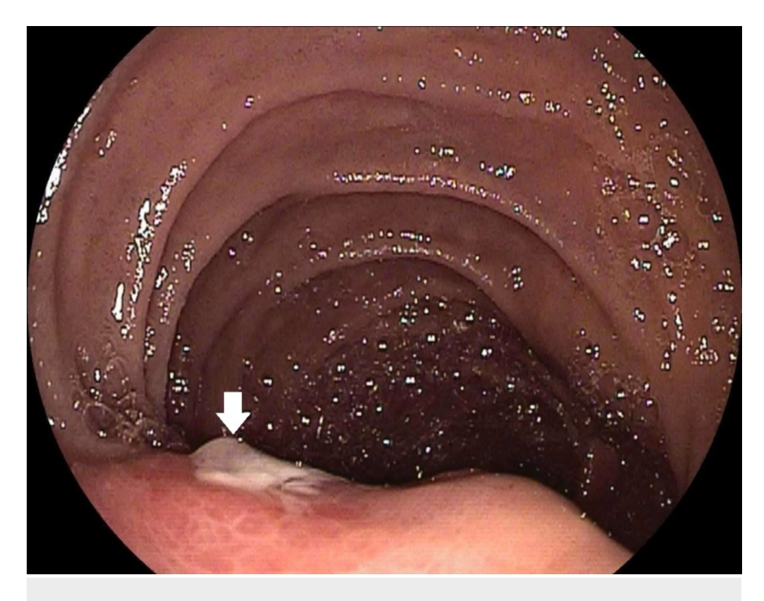
FIGURE 1: Esophagogastroduodenoscopy (EGD) on prior admission.

Front-viewing endoscope showing an ulcerated submucosal mass at the duodenal papilla with no apparent bleeding.