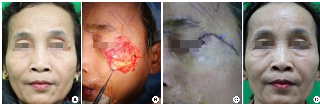
Fig. 2. A 60-year-old woman with a 5×5 mm basal cell carcinoma on the lateral upper eyelid (case 2). (A) Preoperative photograph. (B) The flap was elevated in the subcutaneous plane and advanced superomedially to close the defect. (C) Immediate postoperative view of the reconstruction using a modified Tenzel flap. (D) Appearance at 3 weeks after reconstruction. An aesthetically gratifying result was observed, with a natural upper lid line.