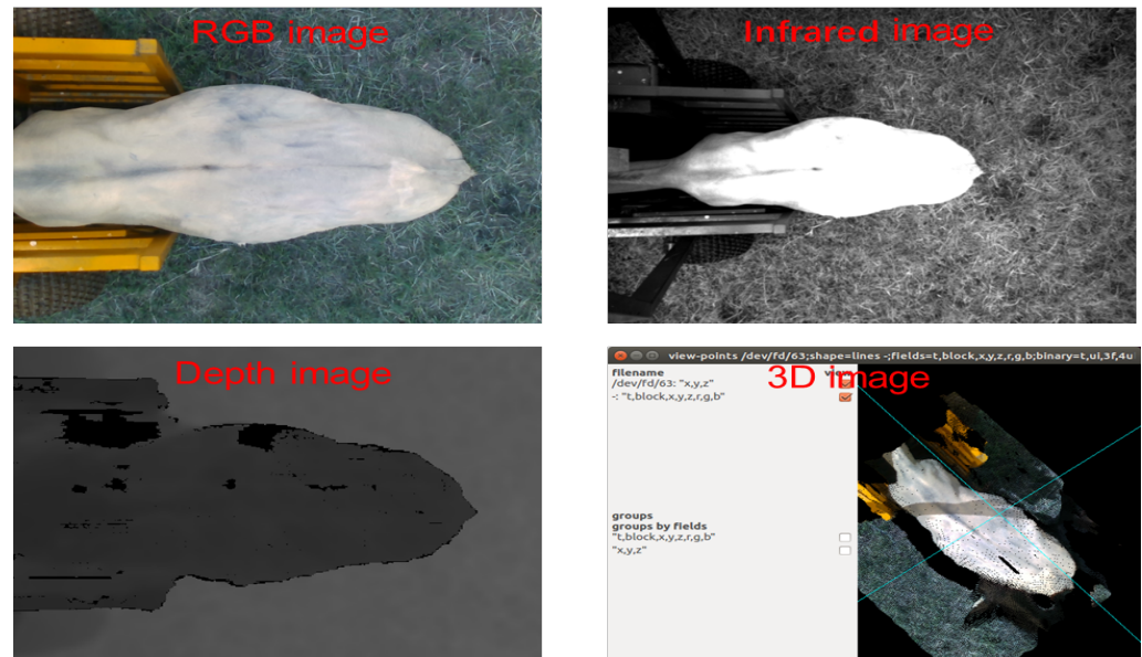
Figure 2. Examples of acquired images from an Intel RealSense D435 camera.

model. Viazzi et al. [38] compared the 2D and 3D camera systems for cow lameness detection and found that both 3D and 2D camera can achieve more than 90% accuracy. In general, compared with 2D camera, 3D cameras obtain more comprehensive information and are more suitable for long-term observation and data collection for lameness detection. However, the processing of 3D information is complex and time-consuming due to its larger amount of data.