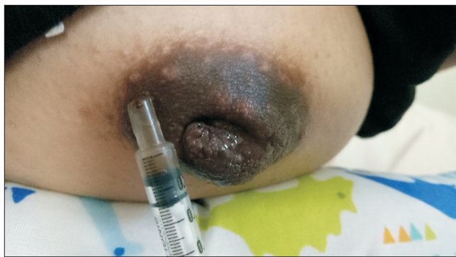
Figure 1. Rusty-colored milk from the breast. Informed consent was obtained from the patient for publication of this case report and accompanying images.

A 29-year-old primigravida delivered a baby boy, with a birth weight of 3,000 g, after 38 weeks of gestation through spontaneous vaginal delivery. She attempted to feed her newborn after delivery; however, the milk did not come out due to the poor attachment technique associated with the bilateral inverted nipple. She was attended by a staff nurse in the ward for inverted nipple using the syringe technique. She noticed bilateral painless bloody nipple discharge while expressing her breast. She observed this phenomenon occurring more on the left breast than on the right breast as shown in Figure 1. She was referred to a lactation unit for further management. The patient denied having any history of trauma to her breast. Her breast examination showed no signs of inflammation, engorgement, tenderness, or palpable masses. The nipples were inverted and showed no cracks, ulcers, or fissures. Examination of the newborn's mouth revealed no natal teeth. She noticed that the nipple discharge color changed from dark brown in the