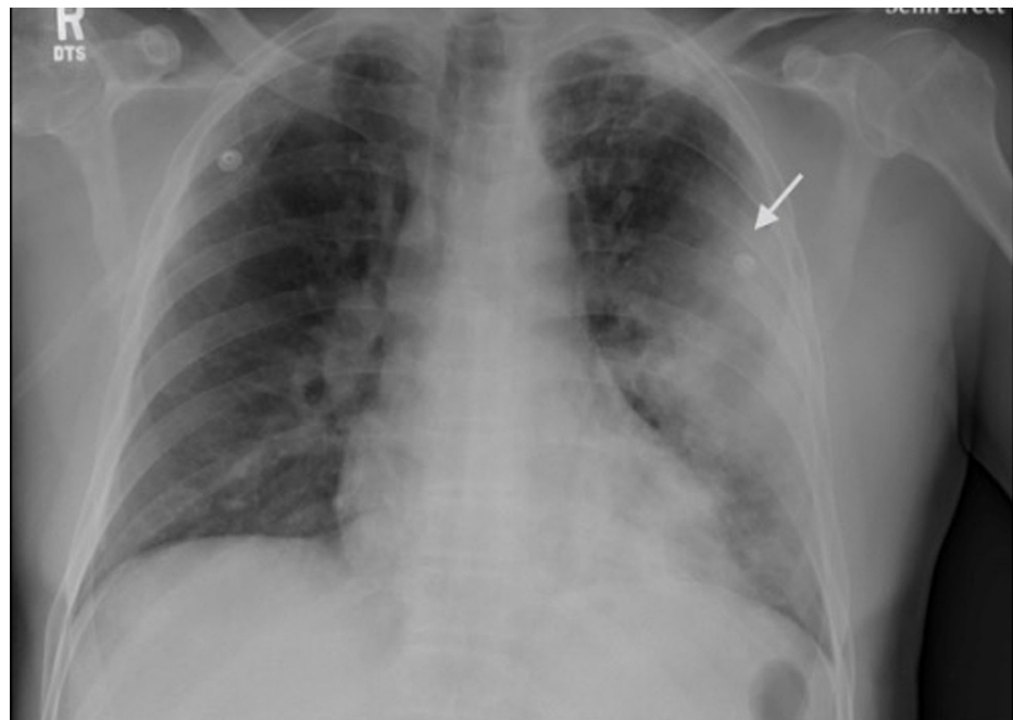
FIGURE 1: Initial chest x-ray showing large airspace consolidation in the left midlung which has a cavitary appearance. Biapical reticular opacities, left more than right.