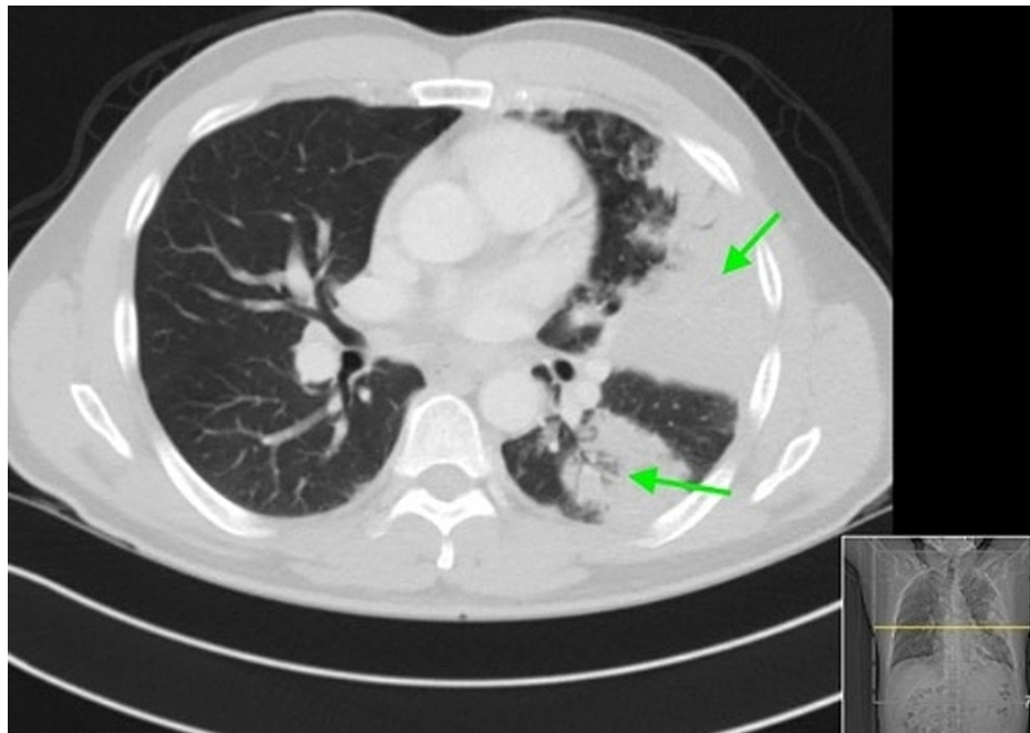
FIGURE 2: CT showing ground glass airspace opacities bilaterally in combination with dense areas of pulmonary consolidation particularly involving the left upper lobe with the consolidation of at least half of the left upper lobe.

An electrocardiogram on presentation demonstrated a coved ST-segment elevation in V1-V2 followed by a negative T-wave, suggesting Brugada pattern type 1 without evidence of ischemic changes (Figure 3). He was initially started on supplemental oxygen via nasal cannula, Tylenol, hydroxychloroquine, azithromycin, ceftriaxone, a regimen that was thought to be advantageous at that time. ECG changes were corrected with the resolution of fever and correction of electrolytes (Figure 3). Throughout the hospital stay, the patient's oxygenation continued to worsen requiring non-invasive ventilation in the form of bilevel positive airway pressure (BiPAP) and eventually mechanical intubation due to progressively worsening hypoxemic respiratory failure. The hospital course was complicated by severe barotrauma, pneumothorax, hypotension requiring pressor support, atrial flutter, and several complicating bacterial respiratory tract infections. On day 54 of hospitalization, the patient went into a systolic cardiac arrest and despite maximum efforts and initiation of full ACLS protocol, the patient unfortunately died.