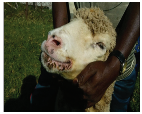
Figure-1: A Bharat Merino suckling lamb showing the exanthematous skin lesions.

As far as the sequence analysis concerned, B2L encoding gene of sheep ORFV isolate 1 from Kodai hills