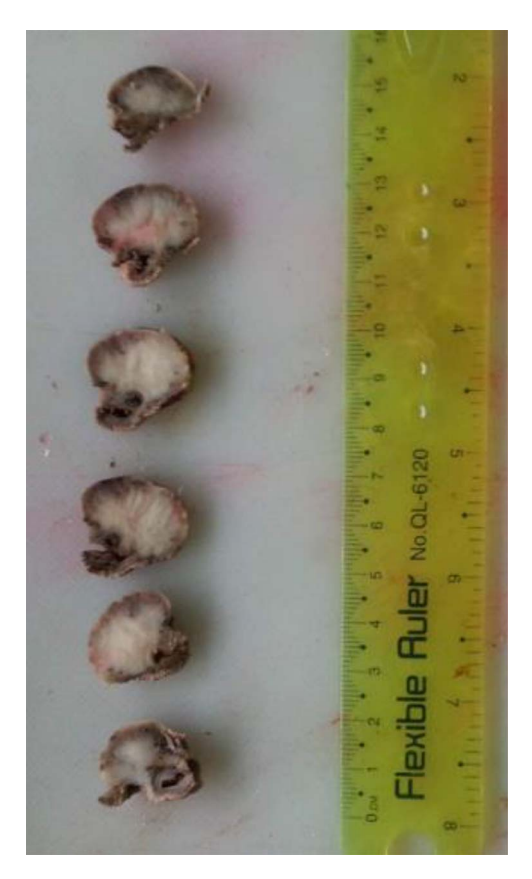
Figure 2: Gross section of the tumor reveals whitish-grey surface with whorled appearance.

Intestinal IMTs lack specific clinical manifestations, and they are usually accompanied by weight loss, malaise and a variety of laboratory abnormalities [7]. Several other atypical presentations have been reported in the literature such as portal venous thrombosis, intussusceptions and anemia [2]. The intussusception of the small intestine was the primary presentation in our patient. Microscopically, the main proliferating cells in IMTs are myofibroblasts and fibroblasts, and immunohistochemically, they show variable positivity for SMA, and vimentin with negativity for CD34, Desmin, S100 and CD117 [8]. The abnormalities of the ALK gene lead to the expression of ALK1 and p80 in the spindle cell components, which can aid in diagnosing these