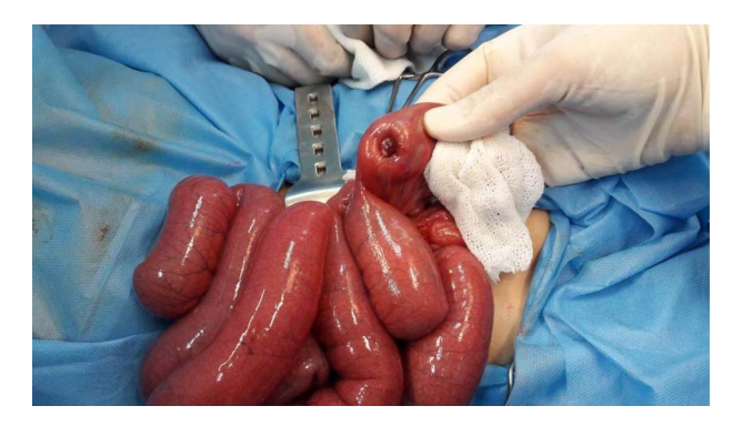
Figure 1: Exploration of the ileum revealed a focally depressed region where a small intraluminal mass was palpated.

valve. During the correction of the intussusception, the surgeon noticed a segmental enlargement of the ileum with the mesentery being focally depressed and palpated there an intraluminal mass (Fig. 1). The enlarged intestinal segment and the appendix were resected.