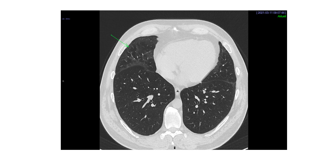
FIGURE 2 | Peripheral subpleural ground-glass opacities compatible with early stage of interstitial lung disease (arrow) are present in the anterior and basal segments of the right middle lobe as well as along the oblique (major) fissure, and on the left side within the lingular segment.

the same coin. COVID-19 shares so many similarities with autoimmune diseases in clinical manifestations, immune responses, and pathogenic mechanisms that it may be difficult to distinguish which immune reactions/symptom/clinical manifestation are COVID-19 related and which are related to an autoimmune disease (20). There are some intriguing similarities between COVID-19 and SSc. Both diseases can be systemic, and high circulatory levels of IL-6, IL-10, and MCP-1 are found in both conditions (21, 22). COVID-19 infection can lead to endothelial damage, as well as SSc, and interstitial lung fibrosis is present in both.