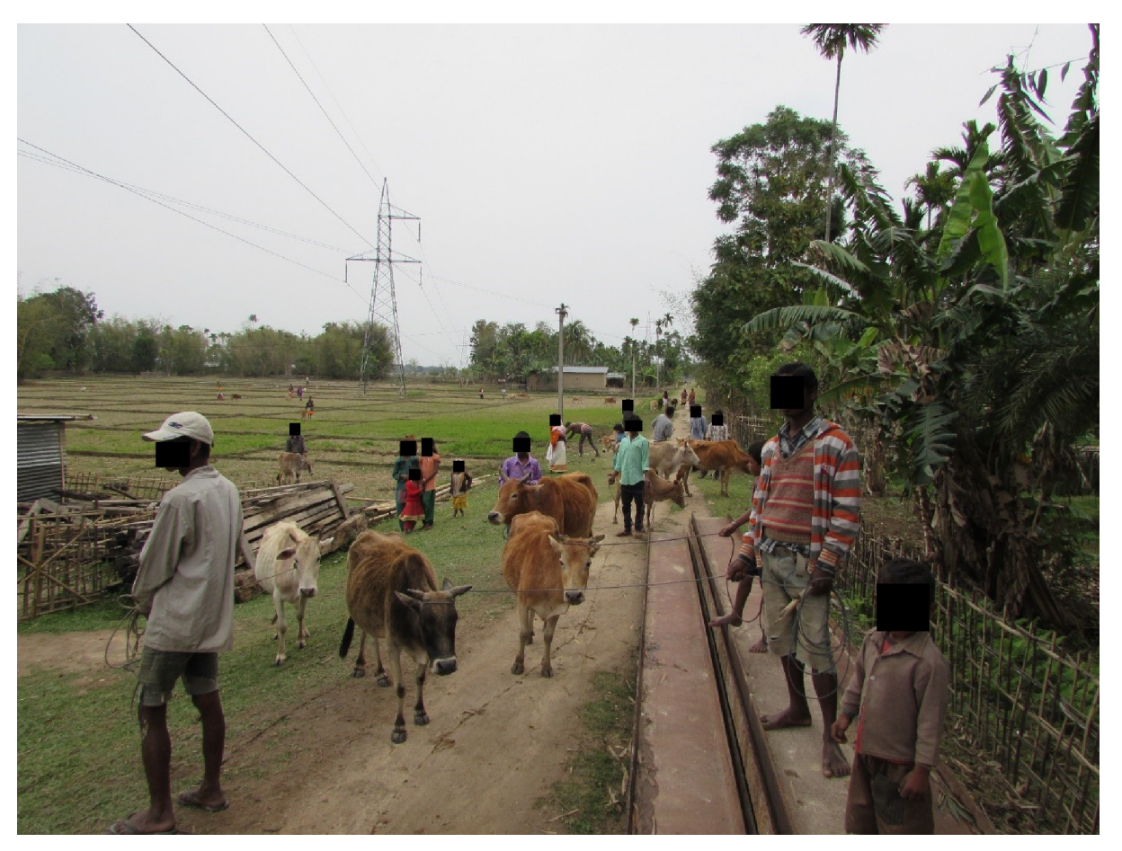
Fig 1. Cattle being gathered for foot and mouth vaccination. Vaccine drives may involve owners bringing their animals to a single site. These programmes are efficient in terms of animal health workers' time. However, some animals may be missed due to: long walking distances involved for people and their animals to reach the vaccination or treatment sites; difficulties in catching and restraining animals; or animal keepers being otherwise occupied at the time. It is noteworthy that small ruminants and pigs are not included in this foot and mouth vaccination drive. Furthermore, bringing animals together in this way could increase the risk of virus transmission, and spread of other production limiting infectious diseases.

vaccines for FMD and HS do not provide 12-months protection, a UK study found adequate protection to be present six months after vaccination with a single injection [42]. Therefore planned immunisation programmes must vaccinate animals prior to the expected period of greatest risk [43]. However, as the seasonal occurrence of these diseases differ, it is difficult to achieve control of all three diseases using once yearly vaccination with trivalent vaccine. This difficulty is compounded by administering a single injection as the initial immunisation, which could result in suboptimal level and duration of immunity [44–47].