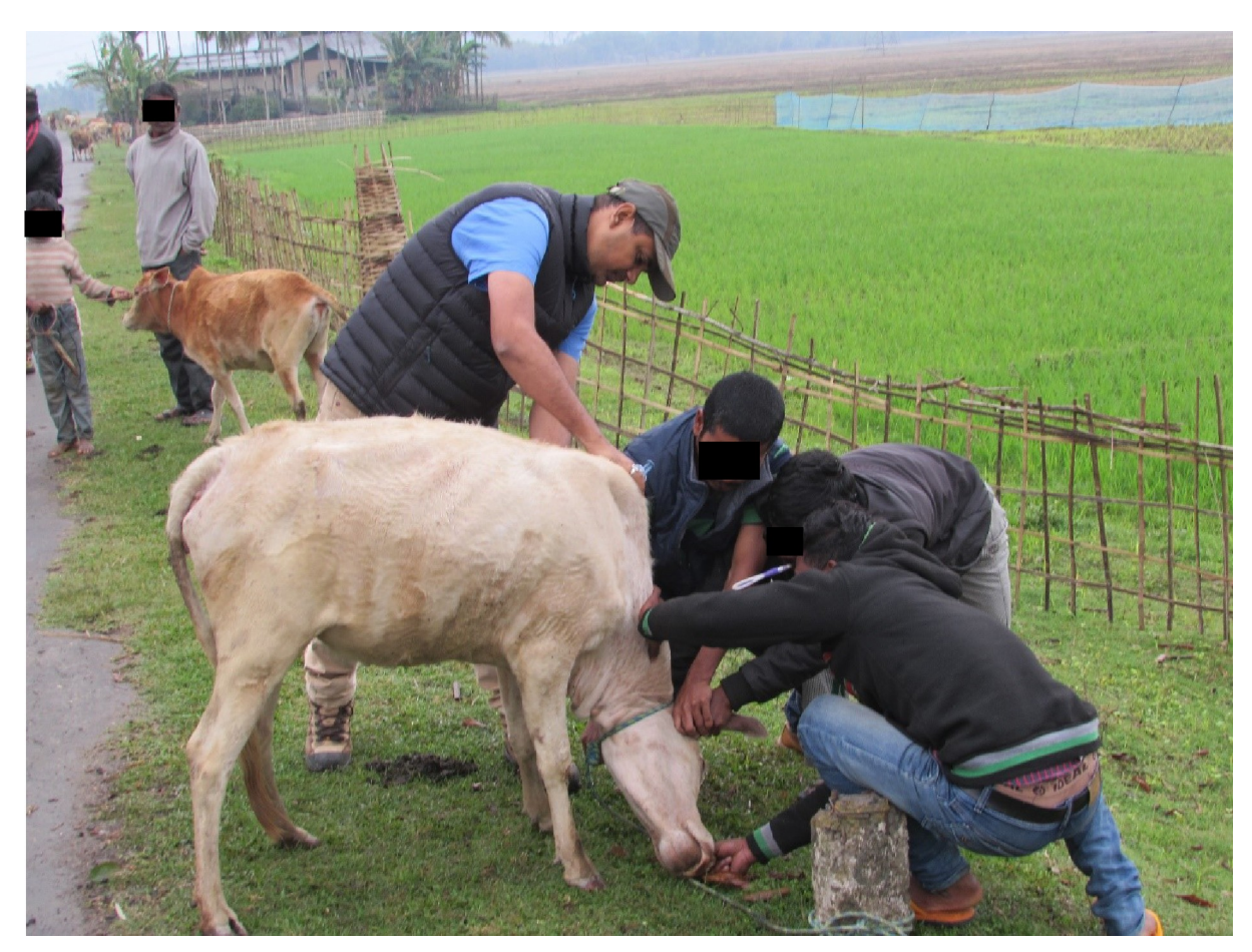
Fig 3. Cattle presented for vaccination at the roadside in front of the keepers house on the fringe of Kaziranga National Park, Assam. Presentation of livestock in front of the keepers home is an effective compromise, allowing vaccination teams to work efficiently. This is an example of the benefit of community engagement in the planning and undertaking of immunisation programmes.

strictly controlled using a permit system. The Buffer zone contains 183 villages, home to around 129,300 humans in 2015 [49]; agriculture is the main form of income in these settlements. Farms are mixed smallholdings, typically less than two acres in size. Entry into the Buffer zone is monitored by the Forest Department. Ruminant livestock represent an important source of productive income and draft power for inhabitants of the Buffer zone.