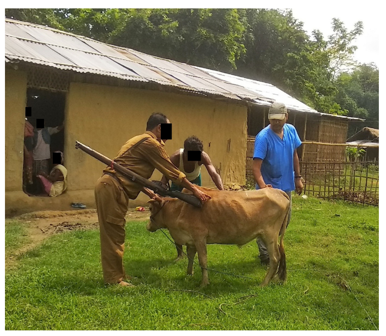
Fig 2. Vaccination team (Forest Dept/ TCF) visiting cattle in their own accommodation for immunisation near the Kaziranga National Park. Vaccination teams visiting every household in a village improves coverage as fewer animals are missed. Owners do not have the problem of restraining their animals in an open area; mixing of animals, which may spread disease, is reduced; and this approach facilitates dialogue between vaccinators and animal keepers.

immunity prior to the predicted period of maximum disease risk. It is often challenging to achieve a level of vaccine coverage that affords adequate control of disease spread through herd immunity. The aim of this work is to better understand reasons why livestock keepers do, or do not, vaccinate their animals, and the factors influencing these decisions. This will aid in the development of pragmatic recommendations to sustainably improve livestock vaccine coverage, including the use of domestic livestock vaccination programmes to help conservation efforts for wild species.