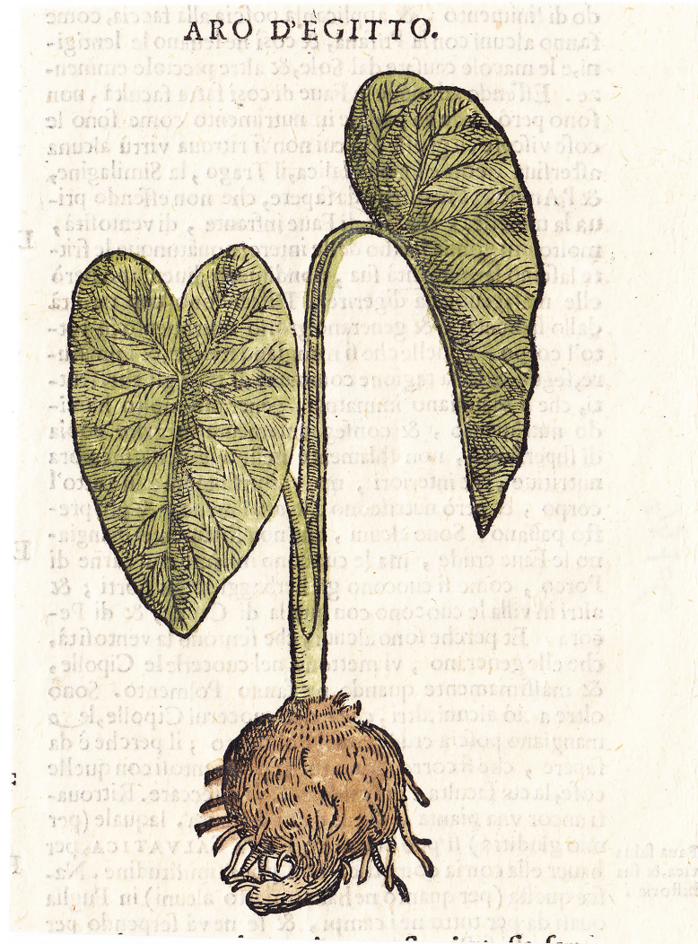
Fig 3. Aro d'Egitto in Mattioli 1580 ca. Commentarii . Drawing of taro made by Augier de Busbecq for the 1580 ca. edition of the Mattioli's Commentarii [27].

https://doi.org/10.1371/journal.pone.0198333.g003