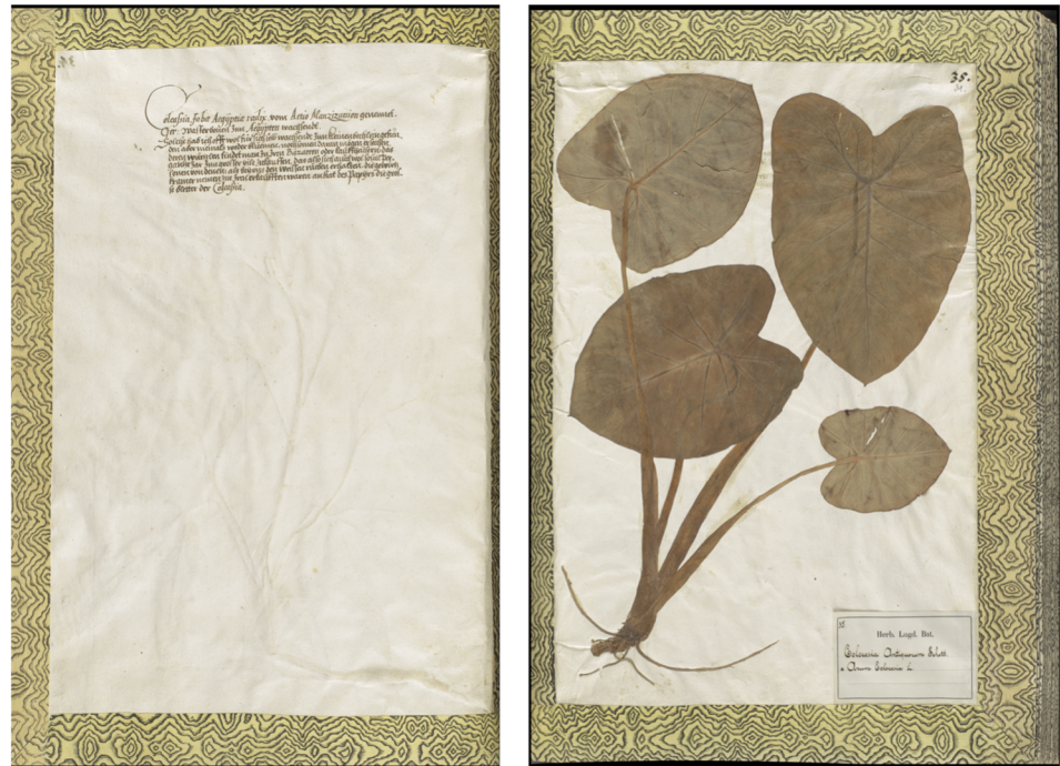
Fig 4. Colocasia in Rauwolf's IVth herbarium. (A) Annotated text and (B) dried sample of C. esculenta collected by Rauwolf in Lebanon during his journey in the Middle East.

https://doi.org/10.1371/journal.pone.0198333.g004