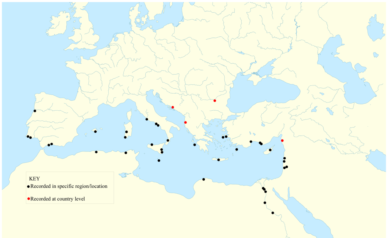
Fig 1. Taro Mediterranean map. Map of taro distribution in the Mediterranean, based on sources reported in the Appendix 1 [S1 Appendix].

Herodotus [33] in his Histories gave a detailed account of the life of people living in marshes of the Egyptian delta. He described the uses of wetland plants 'with poppy-like flowers and