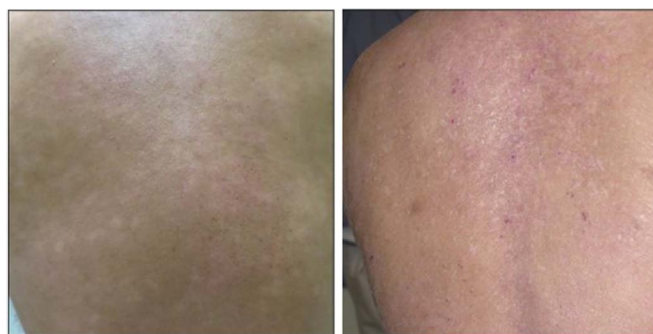
Figure 3. Examples of erythema; both images show an erythema severity score of 2.

A score of 0 indicates clear or no eczema, 0.1 to 1.0 indicates almost clear, 1.1 to 7 indicates mild disease, 7.1 to 21 indicates