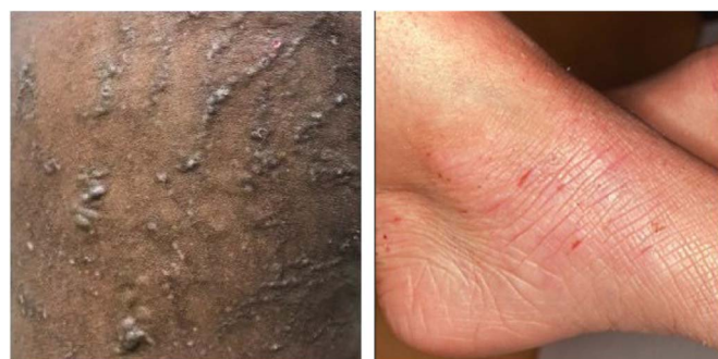
Figure 6. Lichenification; both images show a lichenification severity score of 3.

Edema and papulation represent clinical signs of acute spongiosis and inflammation. These features are typically the most challenging of the 4 AD signs to evaluate by images and are generally best assessed by palpating the skin. Mild edema reflects a barely