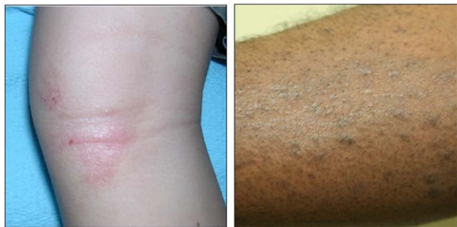
Figure 4. Edema/papulation; both images show an edema/papulation severity score of 2.

moderate disease, 21.1 to 50 indicates severe disease, and greater than 51 indicates very severe disease. 6