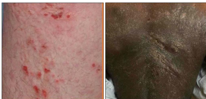
Figure 5. Excoriation, both images show an excoriation severity score of 3.

The EASI was designed to make estimating BSA a simple and straightforward process. The EASI utilizes area assessments that rate the 4 involved regions on a 0% to 100% scale for each region. It is important to note that this assessment is different from how the BSA is estimated by other instruments, such as the rule of 9's in The SCORing Atopic Dermatitis (SCORAD) and BSA calculations using the handprint method. Because the EASI, total BSA, and SCORAD are often included simultaneously in studies and performed at the same visit, confusion may arise, and errors may result. To address this problem, some studies have utilized 1 BSA measurement method