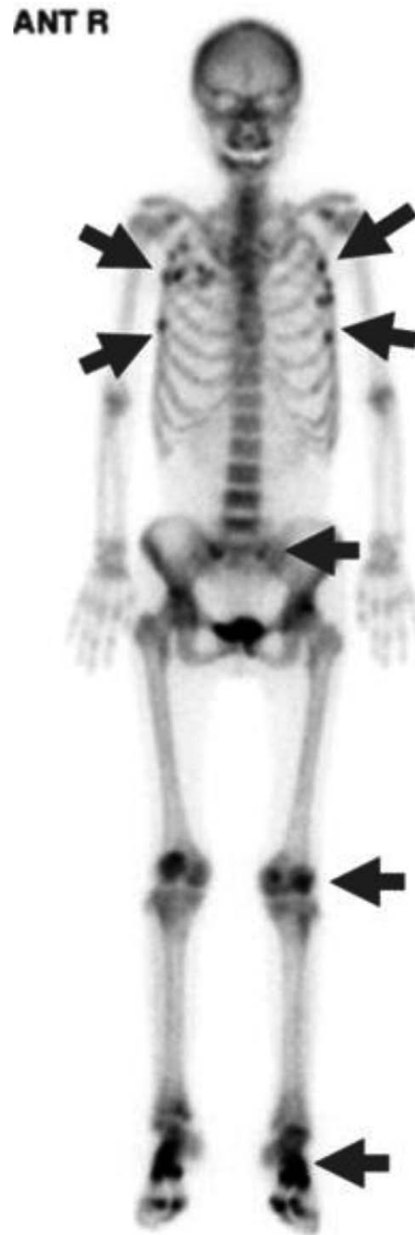
Figure 1. Bone scintigraphy. Bone technetium-99m methylene diphosphate bone scan shows increased uptake (arrows) in the ribs, vertebrae, sacroiliac joints, knee joints, and ankle joints, suggesting multiple bone fractures and osteomalacia.

1,25(OH) 2 D = 1,25-dihydroxyvitamin D, 25(OH)D = 25-hydroxyvitamin D, BAP = bone-specific alkaline phosphatase, FECa = fractional excretion of calcium, FEMg = fractional excretion of magnesium, FGF23 = fibroblast growth factor 23, PTH = parathyroid hormone, TIBC = total iron binding capacity, TmP/GFR = tubular maximum reabsorption of phosphate per glomerular filtration rate, TRACP-5b = tartrate-resistant acid phosphatase-5b.