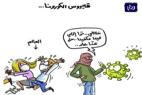
Figure 17. https://www.facebook.com/Royatv/posts/3906129566094471.