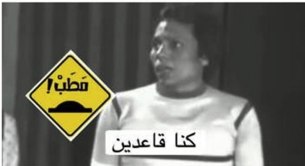
Figure 2. https://www.instagram.com/p/B-hixiBBaeV/?igshid=z2tw6tm8xnqv&fbclid=IwAR0105hv_gRmdgBRIF-bZiUfVtzTBfLWYc8Di4rzBfDZp76ujwEJnpHf2qw . (Permission is granted from copyright right holder, The founder & owner of Matab).

كيف جدك حمى VS كيف انت حميت الأردن الأردن