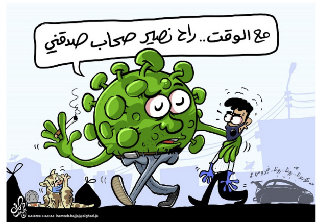
Figure 13.

The caricature in this example reflects people's commitment in following measures. The caption in the dialogue bubble shows ironically