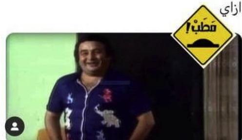
Figure 4. https://www.instagram.com/p/B-zsDGTBEZm/?igshid=ud99dktrfiwr&fbclid=IwAR3FMpSQ2hWueK-lCn5tGrJ9gAsjsbj3WYS670pXJyvwKqzEF8LSx6g_V2o.

الأردن لباقي العالم: شوف ببصلي ازاي، هيموت ويعرف عملتها ازاي