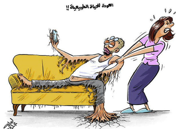
Figure 18. https://www.facebook.com/RoyaNews/posts/4035288843210303.