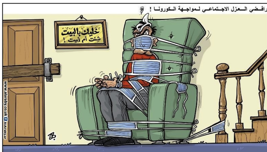
Figure 9. https://www.facebook.com/AlAraby.ar/posts/1688613837945194.

trips, such as buying from groceries and medicine. However, a curfew remained in effect from 6 p.m. to 10 a.m. On April, 2020, the government announced that it would impose a two-day curfew, during which citizens were prohibited from leaving their houses. Then the curfew hours were changed to become from 11 p.m. to 6 a.m.