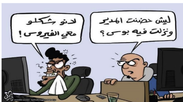
Figure 12. https://www.facebook.com/alghadnewspaper/posts/3988064444538851.