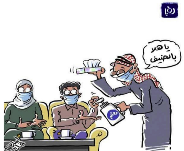
Figure 14. https://www.facebook.com/Royatv/posts/4082515785122514.