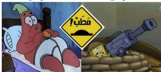
Figure 3. https://www.instagram.com/p/B-b9QBGNz6/?igshid=ifn13rjgfamt&fbclid=IwAR05pLT1fdAdVks5gqCy9MJnFoj82G4xPrGblOnVhIvTzan9FtpZxah4zw.

كيف جدك حمى VS كيف انت حميت الأردن الأردن