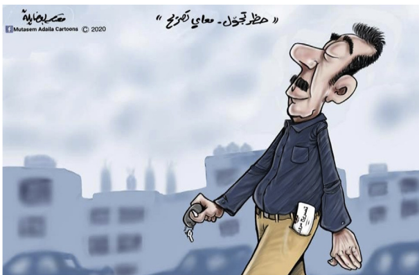
Figure 6. https://www.facebook.com/permalink.php?story_fbid=270042902341799&id=872335212894064.

The message in this caricature also mocks the demand on getting permits during the curfew, as the government allowed applying through the internet in order to get a one-day permit. However, it might indicate that this is part of people’s reaction because of staying at home during this period Figure 7 .