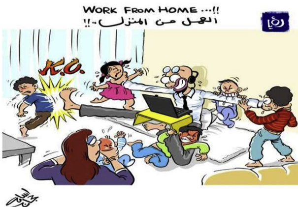
Figure 7. https://www.facebook.com/Royatv/posts/4213777695329655.

As people in Jordan were forced to work from home during this period, this caricature mocks the reality of working from home. It also portrays how a person who usually goes to work dressed formally is now forced to work in a place that is not equipped as a work environment. This is reflected in the image of the man dressing formal and surrounded by little children while trying to work and the caption that says: (Work from home!), The message in this example is realized in an exaggerated sense in that working at home might be difficult.