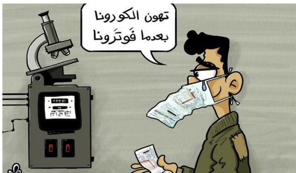
Figure 15.

Humor is a tool that helps people to tackle different aspects of lives with laughter. It can be sometimes a tool to criticize, spot the light upon a