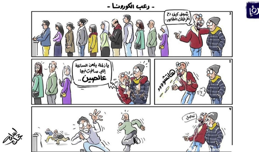
Figure 11. https://www.facebook.com/Royatv/posts/3933549196685841.

Virus, the caricature in Figure 12 shows a similar case. A speaker asks his friend why he has hugged his boss, and the other replies: because I think I am infected! The image of two men, one is wondering while the other looks strange because of the napkin he is holding and the lines drawn around his face and the caption in the dialogue bubbles that says: (-Why did you hug the boss and kiss him?- Because probably I am infected!), show the bitter irony of how the boss's 'hate' is carried on even during the Pandemic. Hence, firstly, this example mocks the boss-employee relationship and how it might reach an extent where he would infect his boss just to get rid of him! Secondly, it might reflect how some people at the beginning of the virus Figure 13.