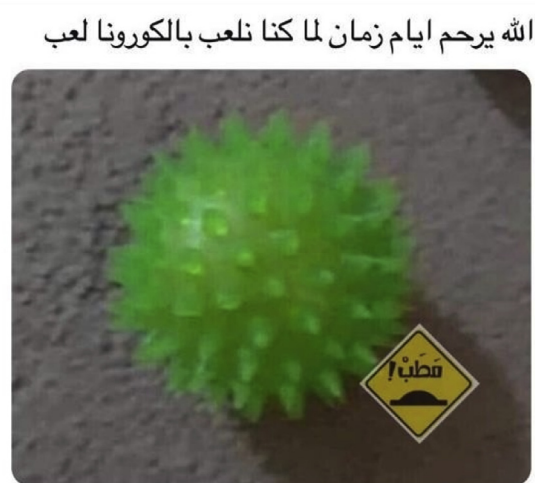
Figure 19.

The study is essentially subjective. It entails a descriptive social semiotic analysis of data. Data consists of fifty (50) memes and caricatures taken from the internet purposively shared on leading social media sites during the Coronavirus Pandemic. However, twenty (20) figures are selected for analysis due to the similarity among some of these data. These are numbered Figures 1, 2, 3, 4, 5, 6, 7, 8, 9, 10, 11, 12, 13, 14, 15, 16, 17, 18, 19 and 20. The analysis focuses on Kress and van Leeuwen's