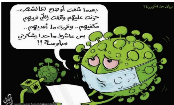
Figure 16. https://www.facebook.com/hamzehhajjajcaricatures/posts/2789947864375962.