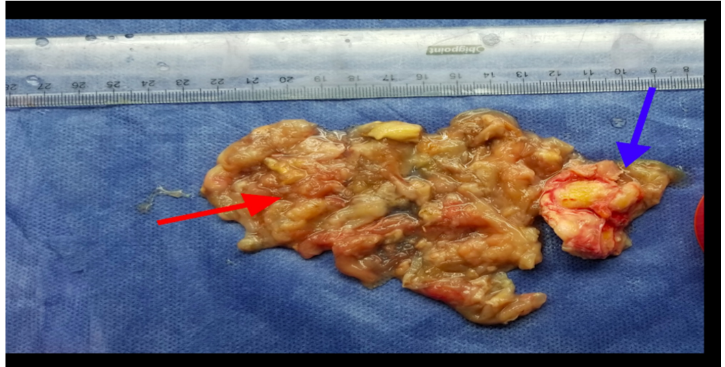
FIGURE 3: Excised specimen of cyst. Calcified cyst wall (blue arrow), dead membranes of daughter vesicles (red arrow)