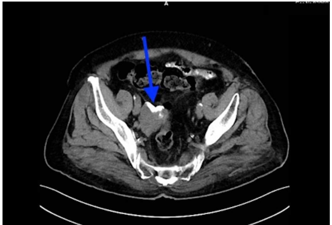
FIGURE 1: Computed tomography image, 5 x 4 cm calcified mass (blue arrow)

surgery, a liquid diet was given. His vital signs were normal on follow-up, and he was discharged uneventfully on the fourth day of the operation. Albendazole 200 mg/day was prescribed to the patient.