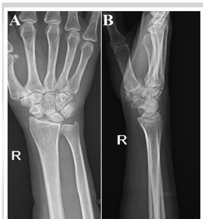
Figure 1: (a) Anteroposterior radiograph of the wrist showing decreased radio-scaphoid joint space and increased scapholunate distance (Terry Thomas Sign). (b) Lateral radiograph of the wrist showing dorsal tilt of lunate, indicating the presence of dorsal intercalated segment instability.

Watson's scaphoid shift test was positive. Her grip strength was found to be 8 kg less than the contralateral side.