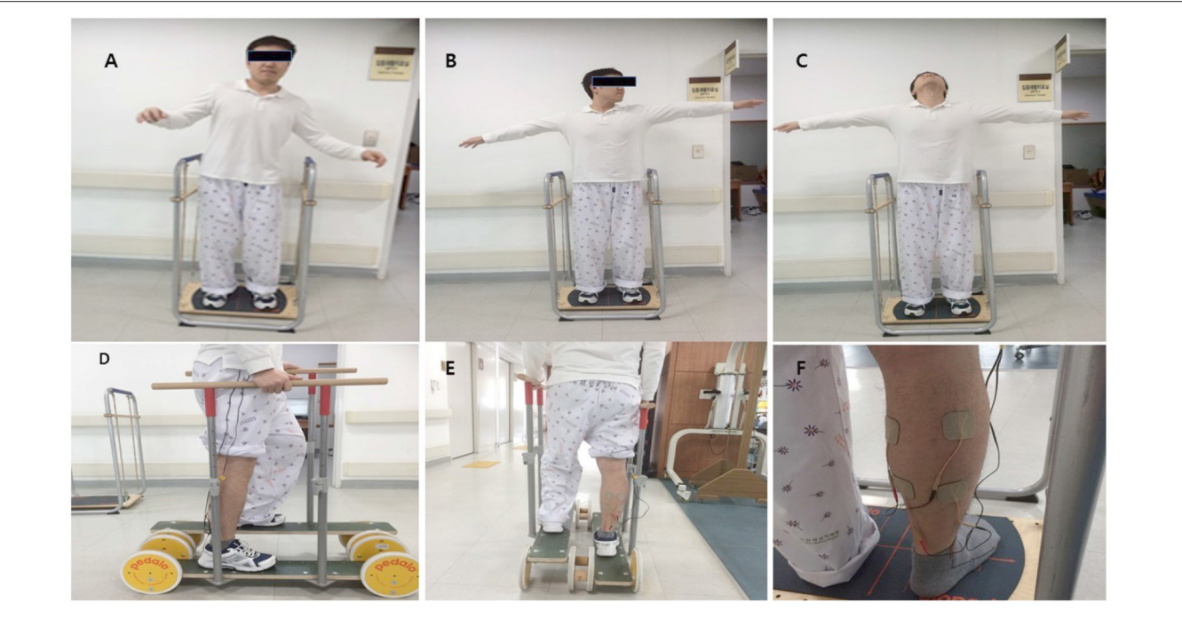
FIGURE 1 | The Stabilize T and Reha-Bar with transcutaneous electrical nerve stimulation (A-C: Stabilize T exercise, D,E: Reha-Bar exercise, F: TENS).

Münsingen, Germany) exercises (18) with transcutaneous electrical nerve stimulation (TENS) for 30 min. The treadmill training group participated in treadmill gait training with placebo TENS (with only adhesive TENS electrodes) for 30 min (19). We applied one of these methods to the patients in accordance with their ability. In all interventions and assessments, if patients complained of discomfort, they were told to stop immediately and take a rest. Both groups received an intervention for 5 days per week for 8 consecutive weeks.