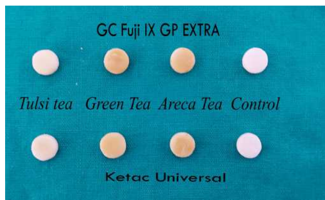
Figure 1 Representative images of staining on GC Fuji IX GP EXTRA and Ketac Universal after 60 days of exposure to various tea preparations.

Our study showed that both the restorative materials stained significantly after the immersion regimen. It can be attributed to the softening and dissolution of the matrix