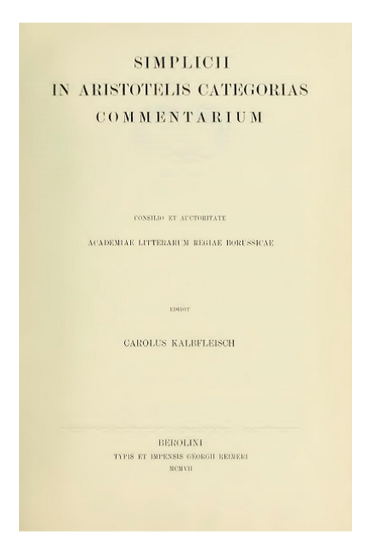
Figure 1. The title page of Simplicius's commentary. 1907 edition, 8th Volume of the Greek Commentaries to Aristotle.

The works of Aristotle are relevant for several reasons. First, Simplicius comments on the work of Aristotle and it is Aristotle, in fact, who is the main object of his study, not Chrysippus. That is why it is necessary to establish whether Chrysippus is treated by Simplicius with due diligence or plays merely an auxiliary role in his text. Second, the works of Aristotle functioned as a point of reference in natural sciences and also with regard to terminology both in classical antiquity as well as throughout the Middle Ages. The categories used by Aristotle, who preceded Chrysippus by a century, will be of use in establishing a timeframe not only for the text written by Chrysippus but also, indirectly, for establishing when the Greeks started to perform cataract surgeries.