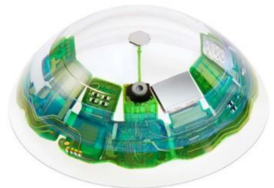
Figure 1 The prototype Mojo Vision smart contact lens with a 14 000 pixels per inch micro-LED display, the world's smallest at just 0.5 mm in diameter, and densest with a pixel-pitch of just 1.8 \mu m, 5G ultra-low latency radio to stream AR content, continuous eye tracking via custom-configured accelerometers, gyroscopes and magnetometers, medical-grade in-lens batteries and eye-controlled user interface. 2 AR, augmented reality; LED, light-emitting diode.

Dr Yannis P Pitsiladis; Y.Pitsiladis@Brighton.ac.uk