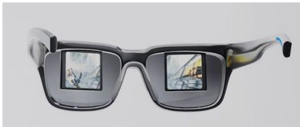
Figure 2 The vision enhancement technology by Innovega is made of display glasses and a smart lens that picks up the images and media from the eyewear display and projects it directly on the retina. Outer filters allow one to see the natural world simultaneously while preventing cross-talk between light paths. 3

hypogonadism, pituitary deficit and thyroid diseases. For such a solution to be implemented in elite sports, the WADA Prohibited List 6 would need to expand to include vision enhancement methods. In readiness for this development, the WADA Prohibited List Expert Advisory Group could conduct a feasibility study to include human enhancement technologies, not limited to vision enhancement. If prohibited either via WADA or the technical regulations of an IF, the physician who treats these athletes (eg, the ophthalmologist) will need to be aware of their specific role and responsibility in applying for a TUE or the equivalent alternative if provided by the IF and in adequately monitoring the use of the prohibited enhancement technologies.