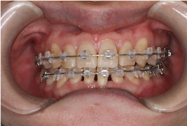
Fig. 1. Preoperative assessment: intraoral photograph.

to the upper lip of Legan-Burstone soft tissue analysis was 6.5mm, similar to the Japanese standard value of 6.5mm. 11 However, it was higher than the White standard value of 3.0mm 11 and suggested a diagnosis of protrusion of the mouth (Fig. 2, Table 1). Tweed's analysis showed that the SNA, SNAB, and ANB angles were 86.7degrees, 85.4degrees, and 1.3degrees, respectively, indicating a tendency toward mandibular protraction (Fig. 3). There was a tendency for skeletal class III with mesofacial recessive growth, and the teeth presented with Angle class I. Hence, the Point A-Koji method was devised to treat midface retraction. The point A-Koji method is a novel surgical method that shifts the soft tissue Sn point forward while preventing the backward movement of the soft tissue. It improves the facies by using an implant metal plate to support the periosteum around the hard tissue point A, which is the deepest point on the maxillary external linear line between the anterior nasal spine and the intermaxillary central incisor alveolar process crest.