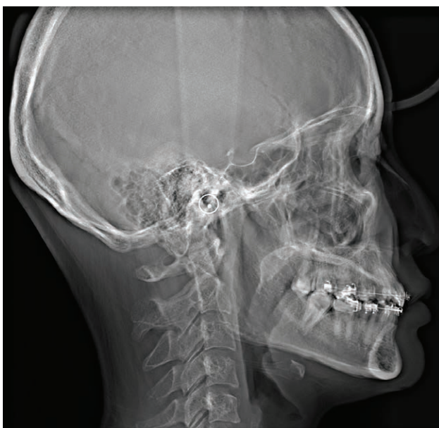
Fig. 3. Preoperative assessment: lateral cephalometric radiograph.

radiographs, hard point A to soft tissue Sn changed from 10.5 mm to 14.5 mm, hard point A to nasal apex (ie, pronasale) from 25.8 mm to 29.1 mm, and hard N-Pog' line to nasal apex (ie, pronasale) from 24.8 mm to 26.1 mm. Therefore, the nasal apex shifted anteriorly.