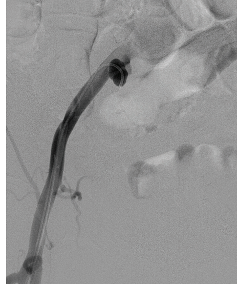
FIGURE 2: False aneurysm of the right common iliac artery demonstrated.

Treatment of a diagnosed or suspected UAF requires a multidisciplinary approach involving urologists, radiologists and vascular surgeons. Open surgery remains the first line treatment [5, 6]. This involves ligation of the involved artery, with or without bypass revascularization, as well as direct suturing with a patch graft in combination with urinary diversion, nephrostomy, or nephrectomy [2]. At least 2 cases in the literature [9, 10] were treated by autotransplantation of the kidney which helped to make a new anastomosis of the ureter possible, since a large part of the ureter had sustained damage as a result of the fistula. Other options include iliac artery embolization with bypass [1] and transrenal ureteral occlusion with Gianturco coils [11].