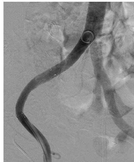
FIGURE 3: A covered stent securely placed in the right common and external iliac artery.

During the past few years endovascular techniques have proven not only to be effective but also very rapid in this emergency condition. A major advantage of the arterial stent is that it does not compromise the vascular supply and there is no need for additional bypass operations [9]. Despite the fact that stents carry with them the risk of infection, they are the best possible treatment options in unstable patients in emergency situations and in patients who are not fit for surgery.