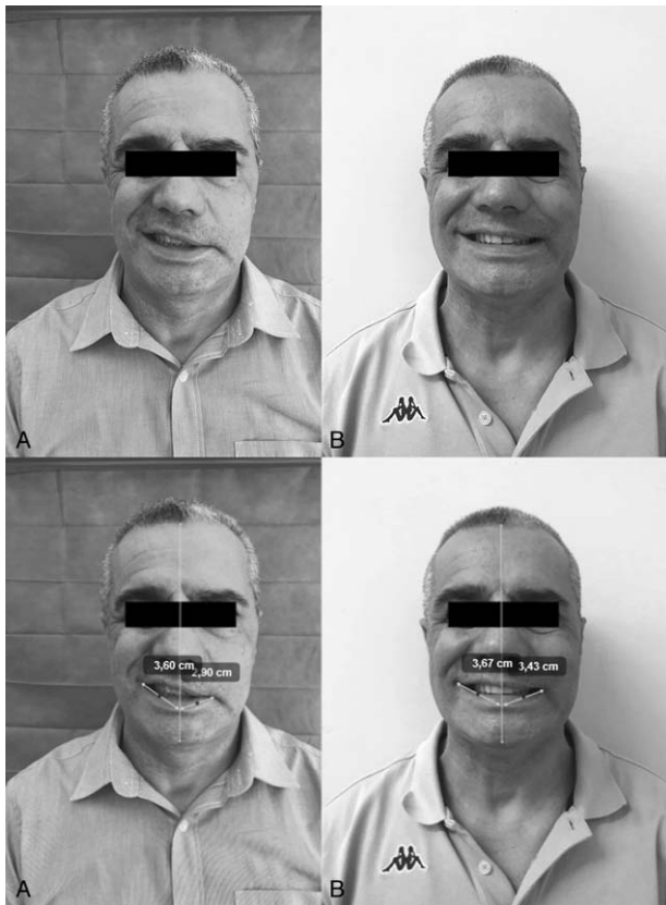
Figure 2. Before (A, B) and after treatment (C, D) using Kinovea© software.