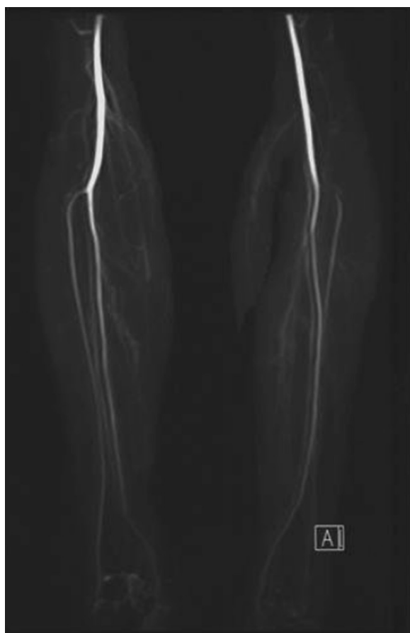
Figure 2 The magnetic resonance angiography findings of the aplastic posterior tibial arteries in both lower legs. The peroneal arteries replaced the posterior tibial arteries at the medial malleolus; right leg (left) and left leg (right).