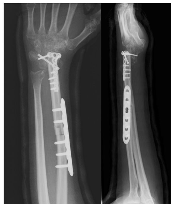
Figure 3 A 10cm segment of fibula bone graft was used for partial wrist fusion.

recommend a routine preoperative anatomical assessment of bilateral lower leg vasculature either by angiography, by MRA or by ultrasonic Doppler flow meter before a vascularized free fibula or fibula flaps procedure [4-7,9]. Young et al. altered the operation plan in all 25% of cases planned for fibula harvest where angiographic abnormalities were detected [6]. However, we consider preoperative angiographic abnormalities in themselves an insufficient reason to abandon the vascularized free fibula procedure. We note that Lutz et al. reported the possibility of a false positive angiography due to vascular spasms and they concluded that clinical evaluation of pedal pulses was superior to angiography as a diagnostic tool in these cases [8].