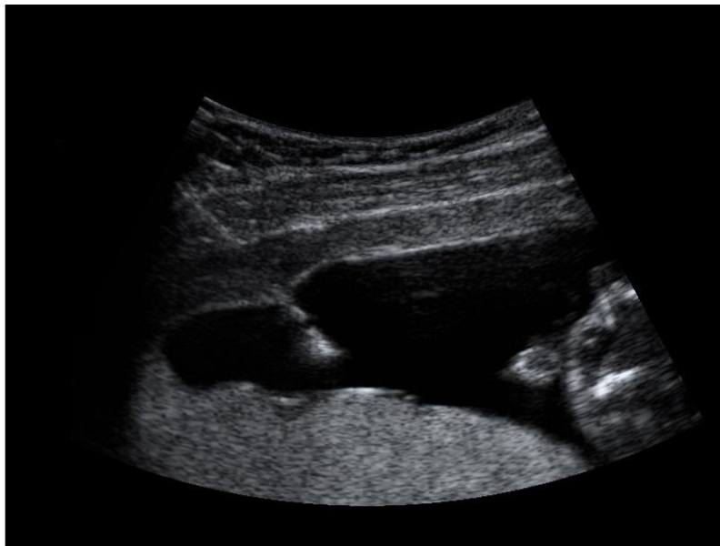
Figure 2. Sonography imaging from amniocentesis procedure.

nancy-related diseases than those without H. pylori [2].