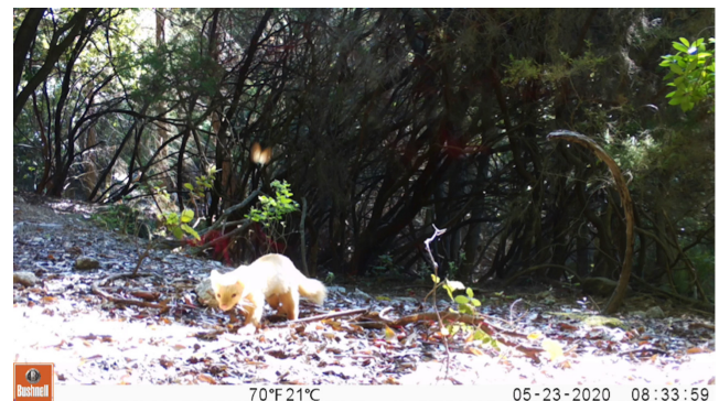
FIGURE 4 Anomalous colored pine marten recorded on May 23, 2020, at 08:34 h UTC + 1 at 42°45'39.7"N, 10°12'10.5"E Pieve di San Giovanni location, Elba island, Italy

the island (42°45'14.0"N, 10°19'02.5"E; 42°45'39.7"N, 10°12'10.5"E, Figure 2 ). Frames from these videos can be seen in Figures 3 and 4 . Subsequent investigation revealed that a pine marten with pale yellow coat had already been seen in the previous months by a local hunter, at the same site where we recorded the aforementioned May video. According to the morphological features (i.e., body shape) of the animals noticeable in the two videos, we could hypothesize that the records concern two different individuals. The distance between the two camera locations (about 9 km, Figure 2 ) might support this suggestion. Although there are no published studies on pine marten spatial distribution on Mediterranean islands, the distance between