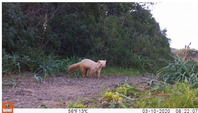
FIGURE 3 Anomalous colored pine marten recorded on March 10, 2020, at 08:22 h UTC + 1 at 42°45'14.0"N, 10°19'02.5"E Lacona location, Elba island, Italy