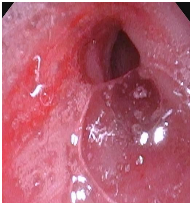
Figure 2 Bronchoscope performed on discharge.

was weaned from VV-ECMO on day 3 following evidence of improvement on chest X-rays. On day 10, the tracheal tube was moved proximally from the stenosis, but tidal volume could not be maintained because the distal end of the tube contacted the stenosis. The tube was reinserted and mechanical ventilation was continued. Tracheostomy was performed on day 28, removal of the tracheal tube was performed on day 41, and the patient resumed oral feeding (figure 2). He was discharged on day 45.