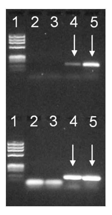
Figure 4. Mini gel patterns of PCR amplified mtDNA. PCR amplification of a fragment spanning the mtDNA HVR-1 region from nt 16307–16405 (D-fragment) and a fragment (H-fragment) harbouring nt 7028 (nt 6987–7047) using extract from subject G2. Upper row, lanes 1–5, D-fragment: 1, size standard ( \Phi X174 RF DNA HeallI-digested); 2, PCR blank; 3, mock extraction; 4, extract; 5, positive DNA control. Lower row, lanes 1–5, H-fragment, same order as for D-fragment. Arrows indicate mtDNA bands.