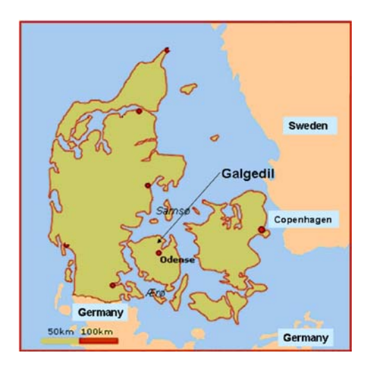
Figure 1. Map of Denmark. The arrow indicates the location of Galgedil in the island of Funen. doi:10.1371/journal.pone.0002214.g001