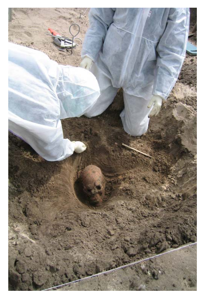
Figure 3. Sampling of teeth for aDNA analysis. The last layer of soil was removed and two teeth extracted while wearing full body suit, hairnet, gloves, shoe covers, and face masks. The teeth were placed in sealed sterile tubes and transported to the aDNA-lab. doi:10.1371/journal.pone.0002214.q003