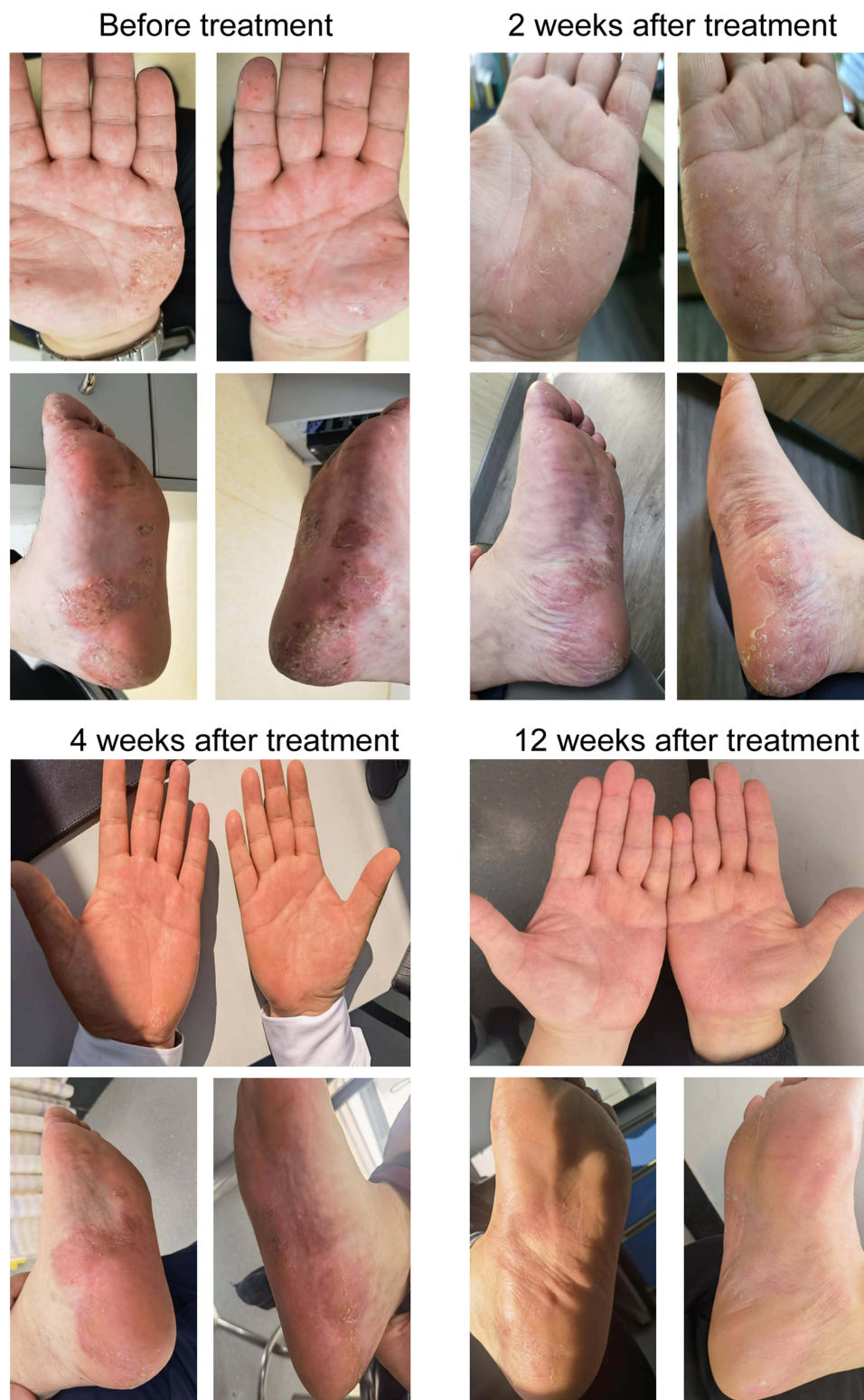
Figure 1 Clinical images of patient I at 0, 2, 4, and 12 weeks after tofacitinib treatment.